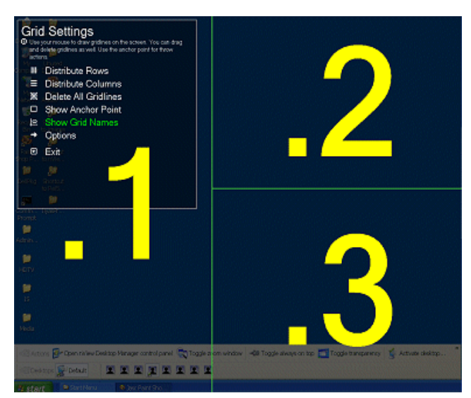
Figure 6: Gridlines

Gridlines are particularly useful if you have one or more very large displays, like a 24 or 30-inch monitor and habitually work with multiple application windows open at the same time. With gridlines you can establish up to ten of these regions if