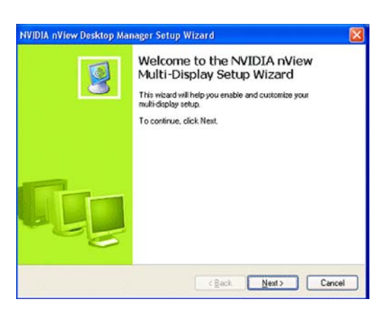
Figure 2: nView Setup Wizard

The first challenge with using multiple monitors is setting up and configuring your displays. nView provides a setup wizard that assists you in configuring your displays quickly and correctly. The wizard helps you set up the most commonly used nView features through intuitive menus. Each step of the way, it prompts you with text, diagrams, and pictures to configure nView to meet your particular needs.