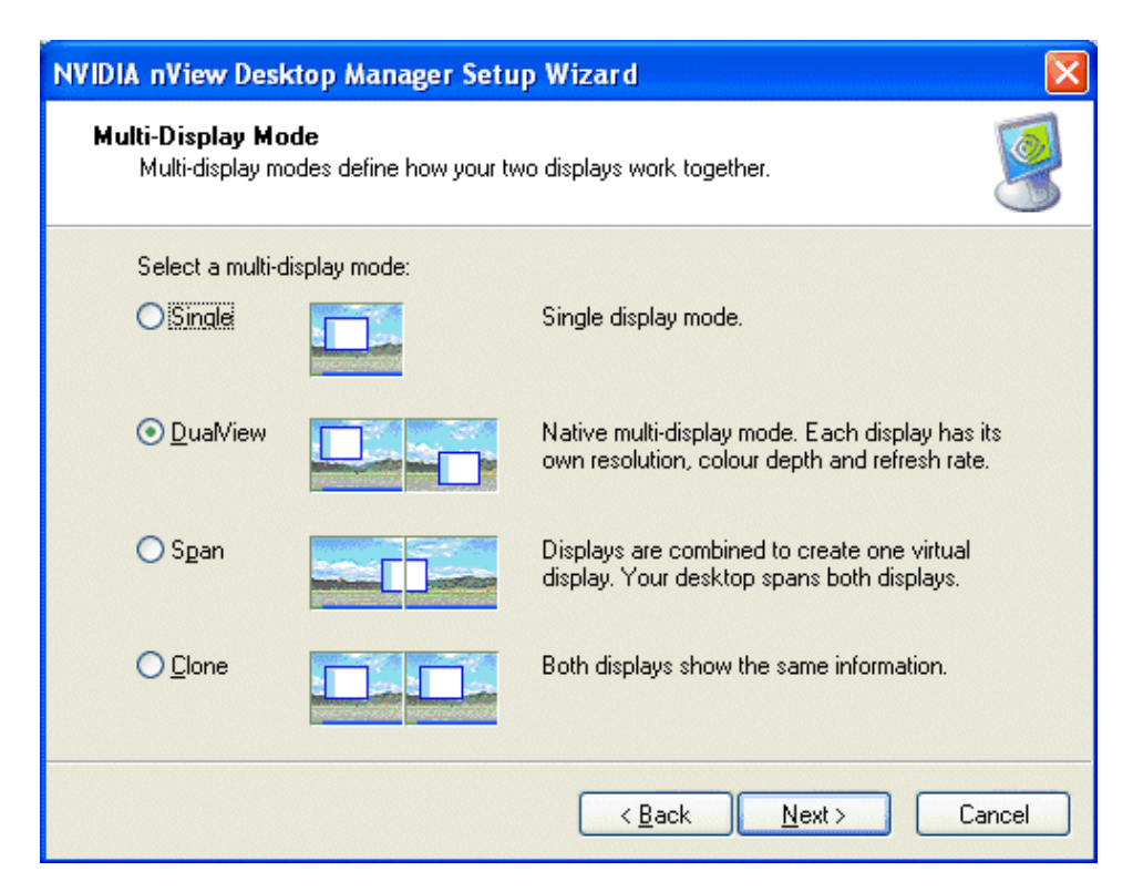
Figure 3. Multi-Display Modes

Whatever your requirements for multiple displays, nView has a mode to meet your needs.