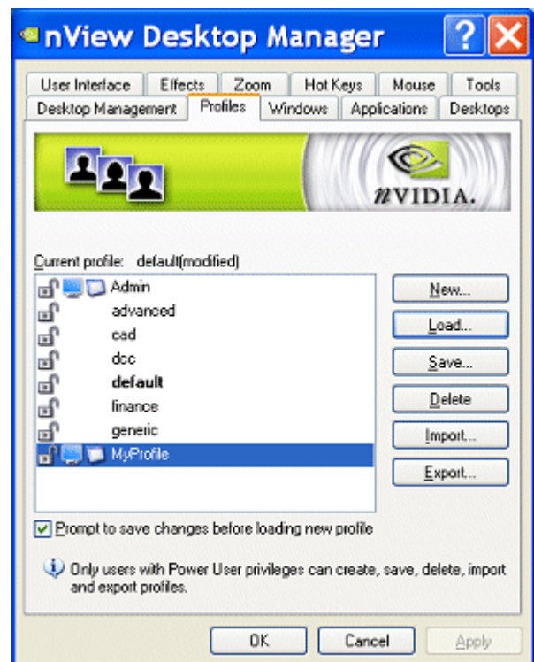
Figure 5: Profiles Control

But even if you're not part of a large organization, you can benefit from the profiles feature if you frequently change your monitor setup. If, for example, you have a notebook that you sometimes run docked with a second monitor and sometimes run standalone, you can set up a profile for each configuration. In this case, you can set up two profiles on your system, a docked