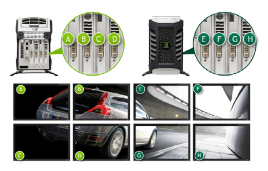
Sample: Eight display configuration from dual Quadro Plex 2200 D2 systems

Quadro Plex scalable visualization solutions provide flexibilty to create environments based on a wide range of needs - from a single 4K display or projector to a sixteen display configuration.